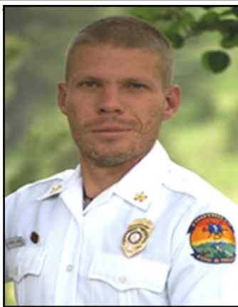
Foothills Fire & Rescue Fire Chief