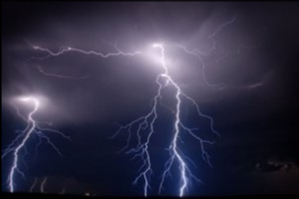
Lightning strikes in Colorado kill an average of one person every year. Two years ago, a hiker in Mathews Winters Park was struck and killed during a dry lightning storm in June.

Did you know that Colorado ranks second in the number of lightning strikes among the fifty states of the United States. Only Florida receives more strikes. Ironic that the highest state and the lowest state hold the number 2 and number 1 spots, respectively.