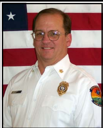
Foothills Fire & Rescue Fire Chief