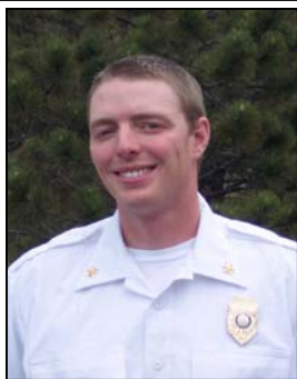
Foothills Fire Protection District Acting Fire Chief