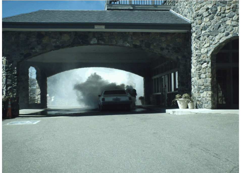
Firefighters extinguish a car fire at the Mount Vernon Country Club

We hope this helps everyone have a little better understanding of what we do and what is expected of the volunteers and staff who help protect your homes and businesses. If you have questions about any of the call breakdowns or statistics, feel free to contact the District Offices and we will do our best to answer your questions.